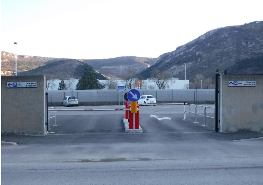
Figure 3 – Gate for accessing the park lot G.