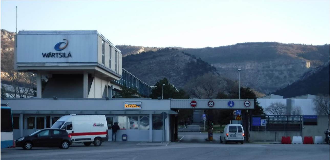
Figure 1 - Wärtsilä Italia S.p.a. main gate (Bagnoli della Rosandra 334, 34018, San Dorligo della Valle (Trieste), Italy).